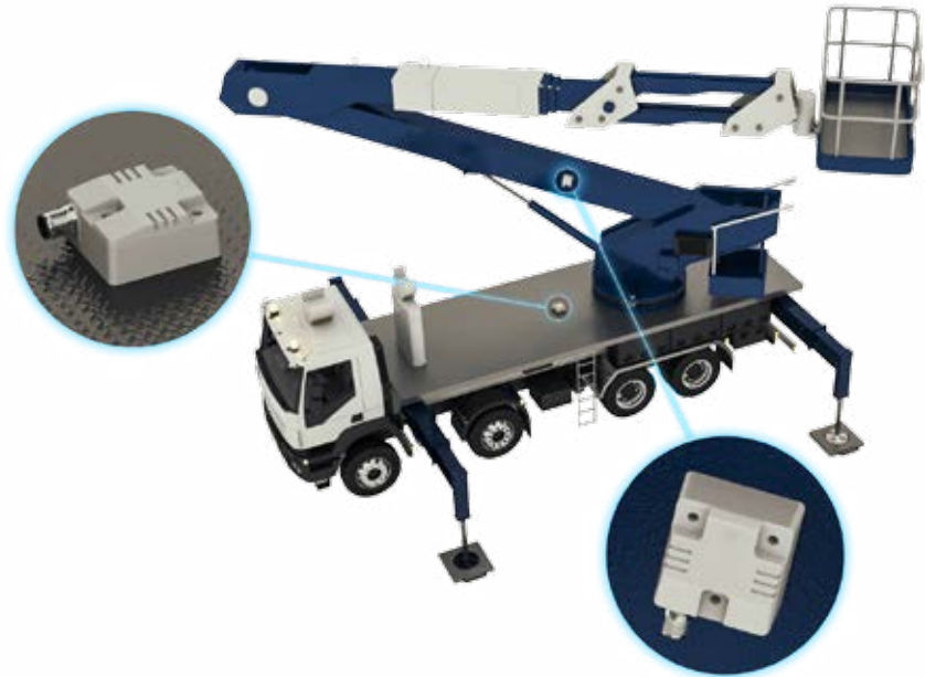
GIM500R: vehicle leveling and boom angle positioning

The new GIM500R series is ideal for the most limited installation space in heavy machinery and vehicles in mobile automation.