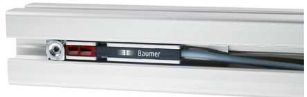
Fig. 3: Sensor with fastening pin

Baumer also offers more intelligent mounting accessories. For example, a fastening pin is available to which the sensor can be attached with a screw. The dimensions of the fastening pin are such that the sensor is protected over its entire length, although the fitted volume hardly increases.