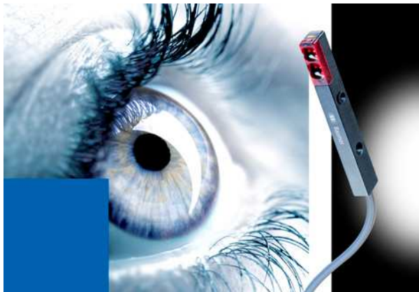
Fig. 1: The smallest optical sensor FHDK 04 with background suppression

In constrained conditions, optical fibers often solve space problems with special sensing heads and matching optical fiber amplifiers. However, two disadvantages must usually be tolerated. With optical fibers, objects cannot or only inadequately be detected against a background and the mounting of optical fibers and amplifiers often incurs more work, adding up to a relatively expensive solution. Baumer now offers a world-wide unique diffuse red light sensor which can solve both problems with its compact shape and very efficient background suppression.