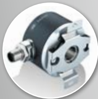
Blind hollow shaft