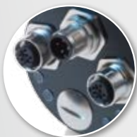
3 x M12