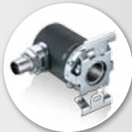
Blind hollow shaft