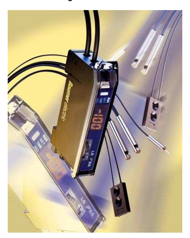
A wide range of fiber optics

Higher integration in all areas of technology requires that sensors become more and more versatile. With fiber optic sensors, this results in a continuously expanding range of different sensing heads. Coaxial fiber optics to position objects, fiber arrays to monitor specific areas and focused fiber optics for identifying highly transparent media in a reflective sensing mode. Baumer electric is now expanding the versatile application range of fiber optic sensors with new solutions to monitor liquid levels and leakage.