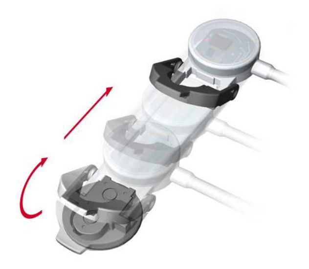
Simple removal with clip-on system

directly to the base plate with two M4 screws. With the user-friendly clip technique, the sensor can quickly and easily be removed from the support bracket for cleaning purposes. The FODK 23x90Y0 is easy to use with simple startup thanks to the fact that it requires no settings.