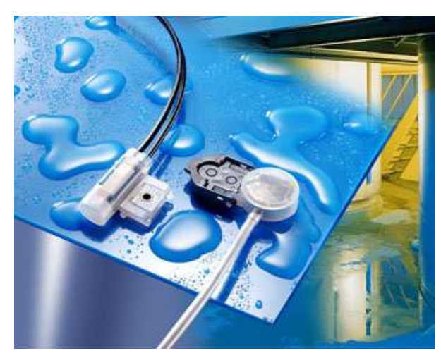
The leakage sensors are mounted on the lowest location, directly under or next to the reservoir

sensors, the operational principle is based on the utilization of the refractive index of liquids. When the sensor is mounted, a focused light beam is reflected from the base plate. If fluid reaches the light beam, it is refracted, which in turn can be clearly detected by the sensor. Because of the Fail-Safe mode with an activated output during standard operation, error sources, such as a cable break or disconnection from the ground, can be definitely detected.