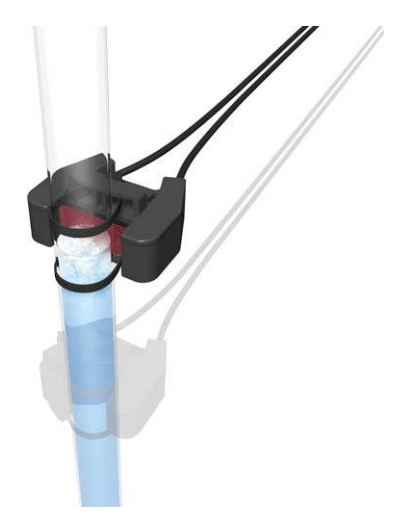
It is possible to ignore foam or air bubbles with the precision light grid

The fiber optic sensor FSL 500C6Y00 with an integrated array is able to ignore foam or air bubbles up to 3 mm in diameter, detecting only the current fill level. This is possible due to an array alignment of the individual fibers. This layout forms a small light grid of approximately 5 mm in length within which a single drop or fine foam has less influence compared to a round light spot. Undesired effects can be corrected with the "teachable" Series 69 high performance fiber optic sensors. In addition to the fiber optic version, a more economical sensor model FFDK 16x50Y0 with integrated electronics and round light spot is also available. The sensor can very easily be attached to the pipe/hose and does not require any adjustment, simplifying start-up. The only selection that has to be made is light- or dark operation.