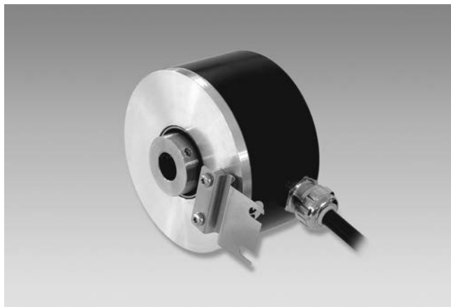
ITD 41 A 4 with blind hollow shaft