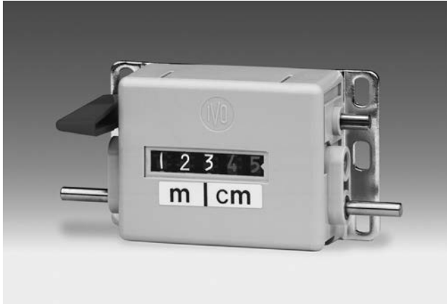
M 310.A - PTB Meter counter