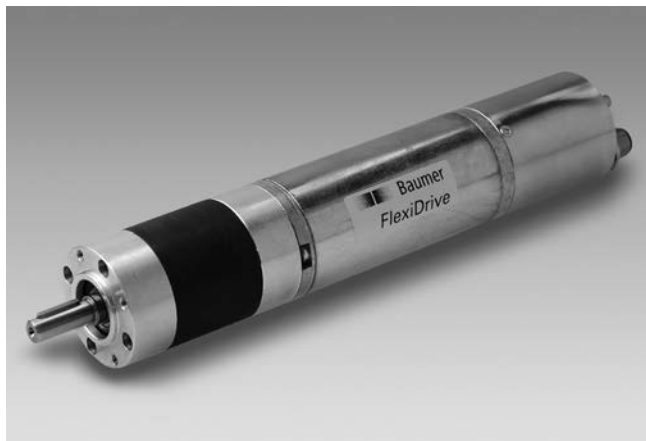
MSBA 42 with axial output