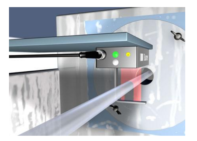
Fig. 4: Using line sensors to measure wire and cable widths for quality control purposes

Baumer's line sensors present a solution for direct width measurement. These sensors quickly and precisely measure in a lateral direction and are also able to detect transparent objects.