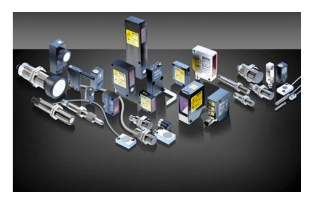
Fig. 1: A large standard portfolio of measuring sensors

Industrial equipment operators are constantly seeking ways to improve precision in the regulation of their automated processes. This in turn leads to more complex automation solutions, coupled with a need for increasingly detailed information related to every process state. Here, contactless measuring sensors provide a solution, as one sensor can provide a variety of information. A single sensor can detect a range of object positions, position changes, speeds and and make this directions, information available to the controller. With its broad standard portfolio of measuring sensors utilizing a wide range of technologies, Baumer can offer solutions for the most varied needs.