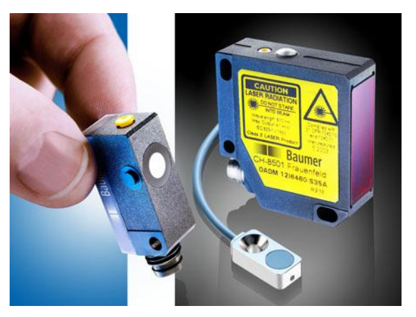
Fig. 8: Powerful distance measuring miniature sensors

inductive sensor contains the unit's entire electronics. With a response time of < 1 ms and a resolution of < 1 \mu m , this sensor represents a very reliable solution, for example, for precisely measuring the eccentricity of shafts. Among photoelectric sensors, the OADM 13 is one of the smallest laser distance sensors with integrated processing electronics on today's market. Regardless of the color or the material involved, the sensor can measure with a resolution of up to 10 µm over distances up to 550 mm, and its response time for this task is less than 0.9 ms. This sensor is therefore particularly suitable for high precision positioning tasks or profile measurements. The UNDK 10 ultrasonic sensor is the smallest and lightest (4 g) sensor of its kind available in today's market. Its very narrow sonic beam angle permits fill level measurements of containers with small openings as well as measurements of very small objects - all this at measuring distances up to 200 mm.