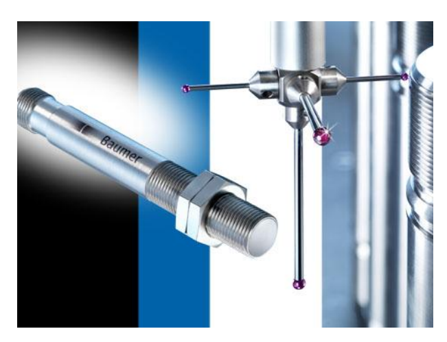
Fig. 7: High precision inductive measuring sensor offering 4 nm resolution

Baumer emphasizes precision across its entire standard portfolio of measuring sensors. This results in highly accurate and reproducible measurements from temperature-stable sensors. For example, the OADM 12 photoelectric laser distance sensor provides measurements with a resolution of 2 µm. In the area of ultrasonic measurements. Baumer offers the UNDK 09 sensor with its special beam columnator. When measuring small objects or "peering" into small openings, this sensor achieves a resolution of 0.1 mm, which represents a volume resolution of up to 1 µl. Baumer's IPRM 12 inductive sensors provide a particularly high resolution level of up to 4 nm. For many applications, three different solutions are available - high resolution at high levels of linearity or for large measurement ranges, or a large measurement range with low temperature drift. For users this commitment to consistent high precision means high sensor reliability in every application.