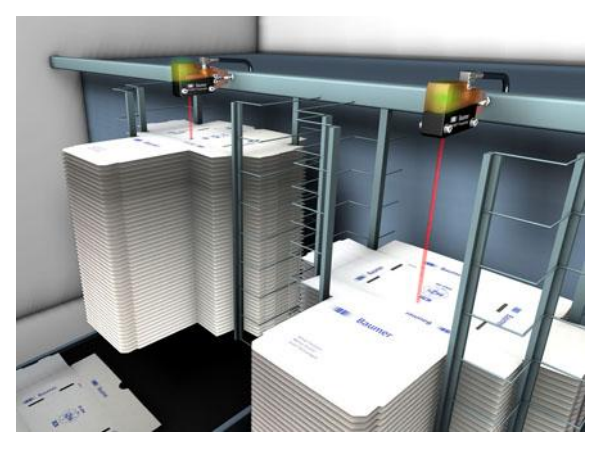
Fig. 2: Using photoelectric sensors to measure stack height in the printing or packaging industry

Photoelectric sensors are frequently employed for applications like these. Their measurement speeds and accuracy are both high, and their measurements are generally not affected by the nature of the materials being detected. Narrow light beams are particularly useful for applications in the handling industry, where sensors confined in very tight spaces must peer past numerous moving arms. Here, Baumer can offer a variety of sensors employing red light or lasers as a light source and covering a broad spectrum of accuracy levels and distances.