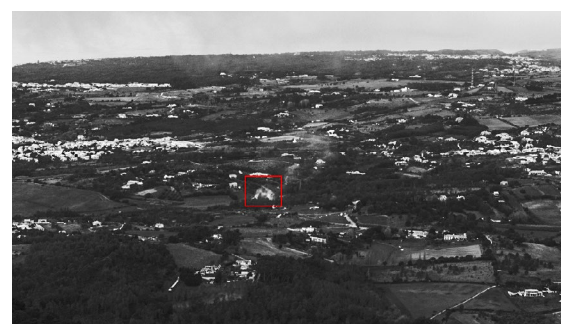
Fig. 4: While still in the monitoring tower, a feature-based algorithm and AI in Sintra evaluate the image data from the cameras and, in the case of suspicion, alert an operator within approx. three minutes, who then decides on the further course of action.