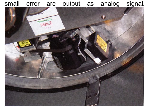
Figure 2: Laser light meter

Sensor Solutions Motion Control Vision Technologies Process Instrumentation