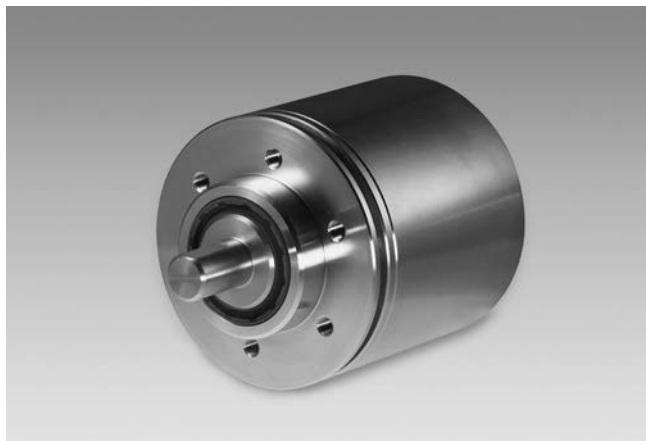
X 700 with clamping flange